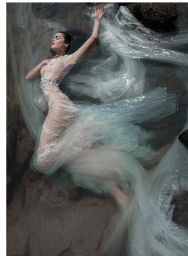
Venus In The Sunlight